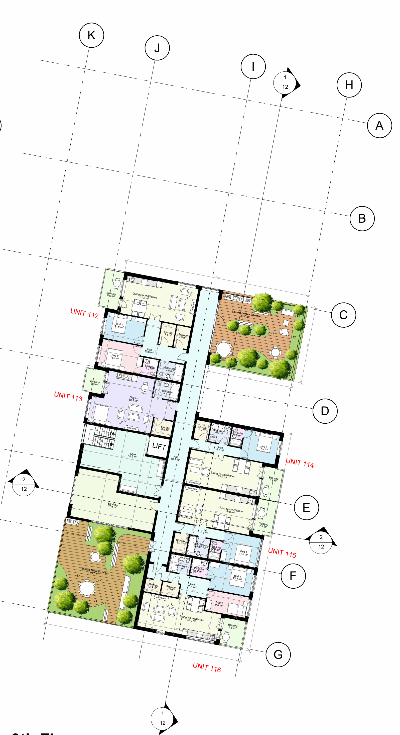
9 9th Floor 1 : 200 FLOOR AREA: 463.34 sqm, FFL: +33.25 STUDIO - 1 1 BED - 2 2 BED - 2 TOTAL - 5

Copyright CPWA Planning & Architecture Copyright and ownership of this drawing is vested in CPWA Planning & Architecture whose prior written consent is required for its reproduction /publication in any form. No dimensions to be scaled from this drawing. Dimensions to be checked on site and any discrepancies to be notified to the Architect