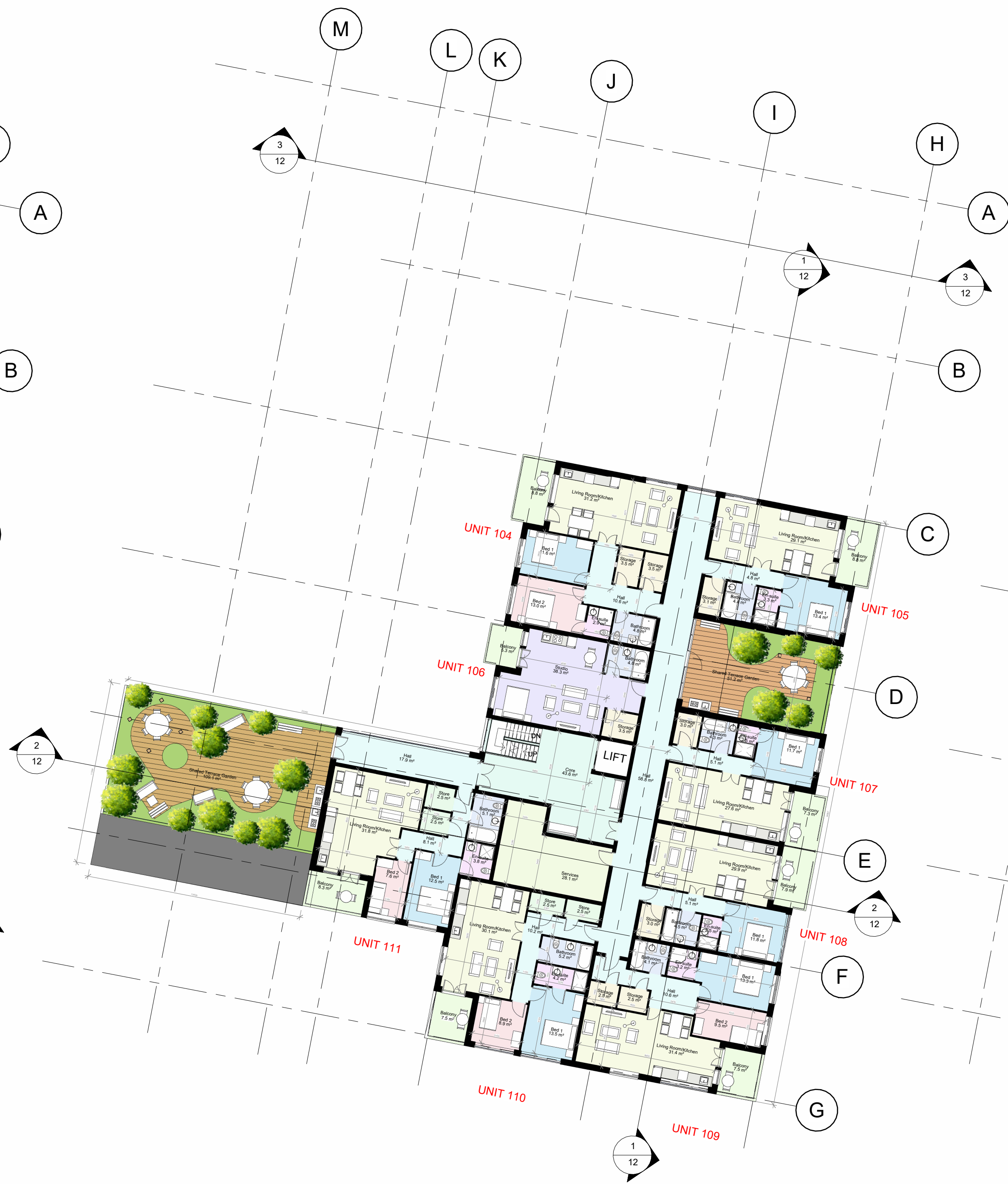
8 8th Floor 1 : 200 FLOOR AREA: 750.09 sqm, FFL: +30.55 STUDIO - 1 1 BED - 3 2 BED - 4 TOTAL - 8