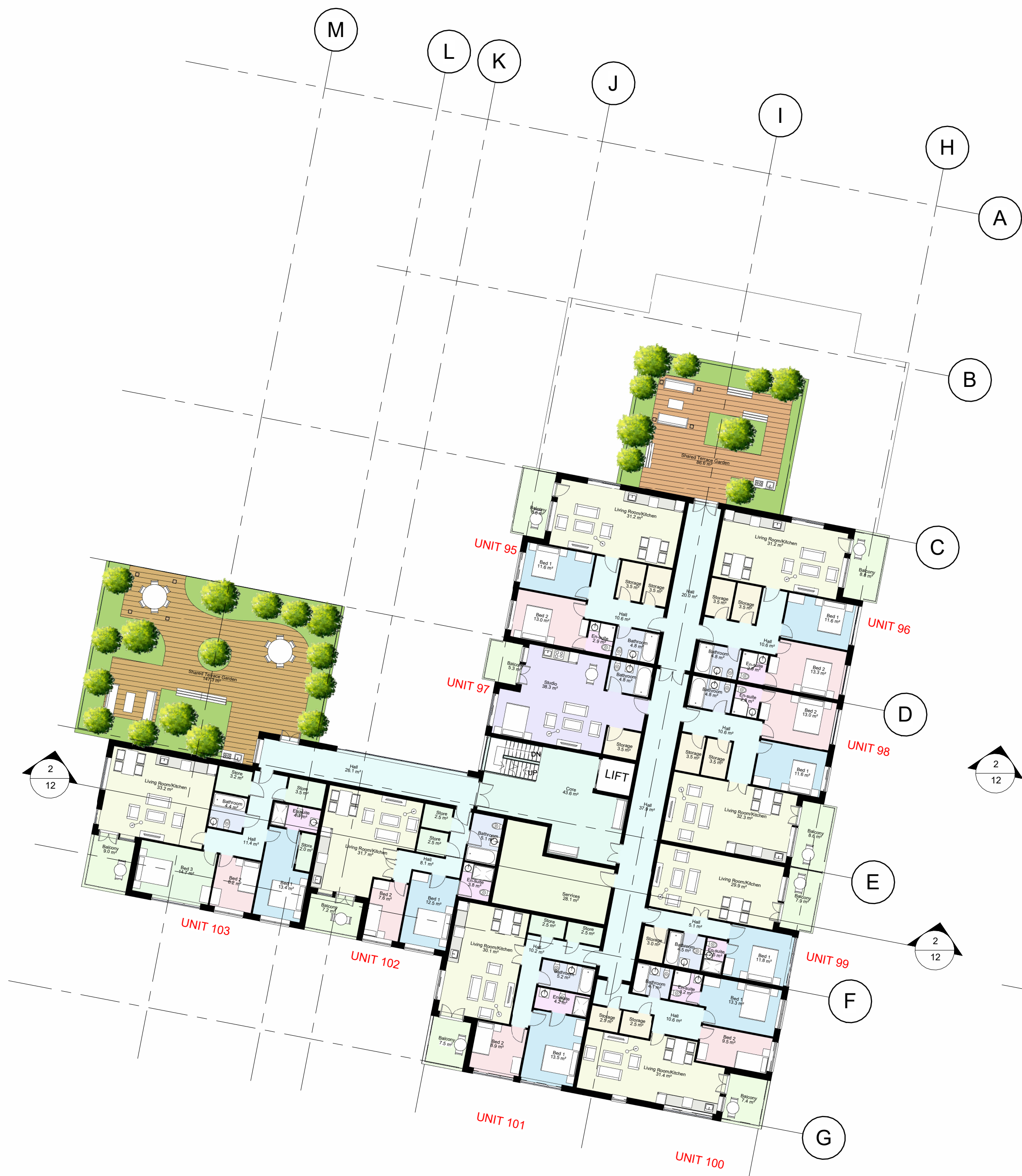
7 7th Floor 1 : 200 FLOOR AREA: 864.30 sqm, FFL: +27.85 STUDIO - 1 1 BED - 1 2 BED - 6 3 BED - 1 TOTAL - 9